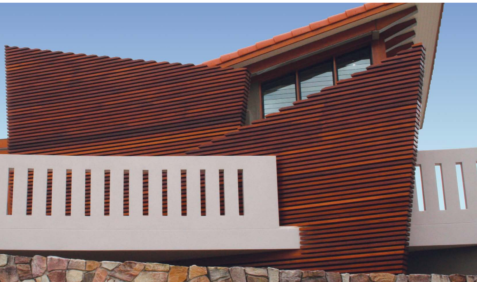
Architectural screen — square dressed sections