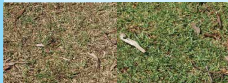
Domestic Lawn in Summer

eco-hydrate is enriched with a blend of seaweed, fulvic and amino acids. Together they enhance antioxidant levels, improve plant functions like root development and reduce stress factors in plants. This is particularly useful when coping with drought stress.