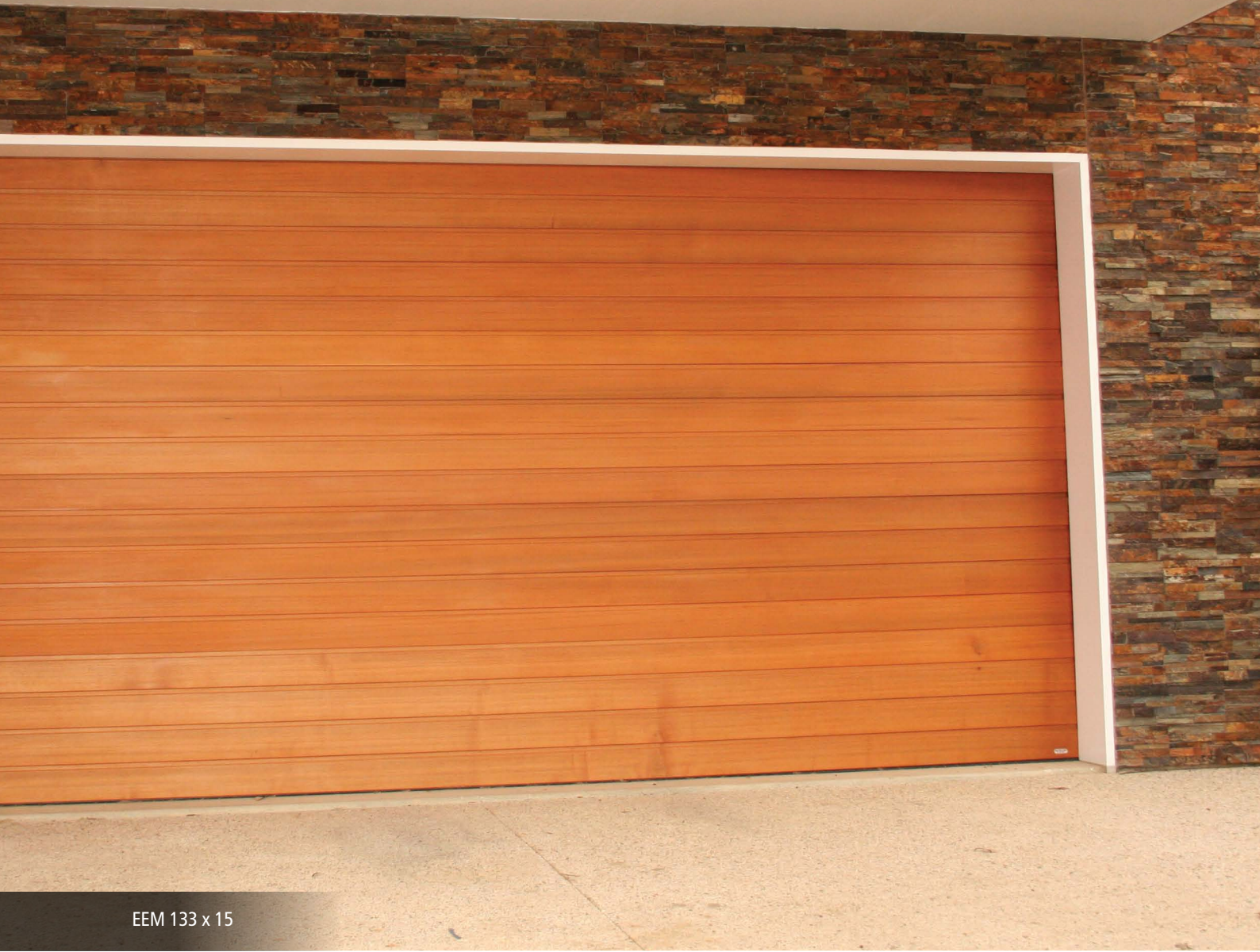
EEM 133 x 15