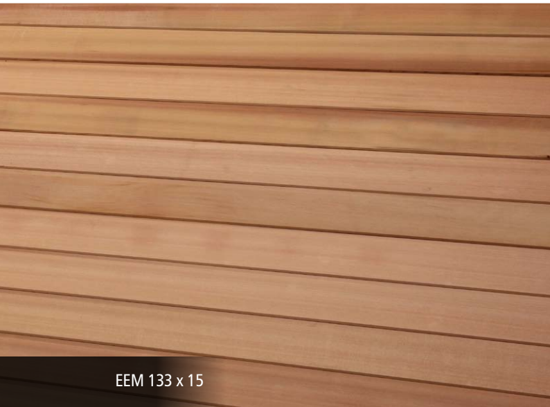
EEM 133 x 15