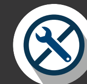
TOOL-LESS DECK REMOVAL