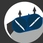
STURDY OFFSET DECK