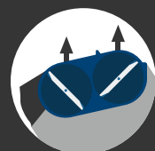
STURDY OFFSET DECK