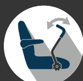
ADJUSTABLE LAP BARS