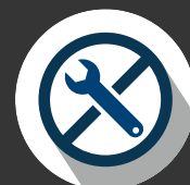
TOOL-LESS DECK REMOVAL