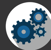
HYDROGEAR T2 TRANSMISSION