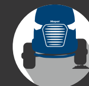
PIVOTING FRONT AXLE