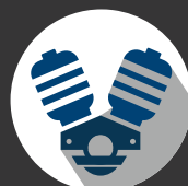
KAWASAKI 18HP ENGINE