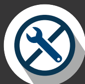
TOOL LESS DECK REMOVAL