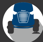
PIVOTING FRONT AXLE