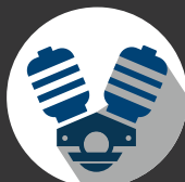
BRIGGS & STRATTON ENGINE