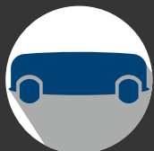
ANTI SCALP WHEELS