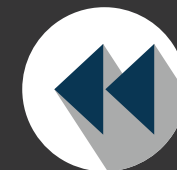
REVERSE MOWING CAPABILITY