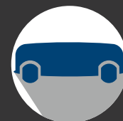
ANTI SCALP WHEELS