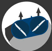
STURDY OFFSET DECK