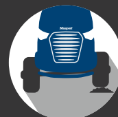
PIVOTING FRONT AXLE