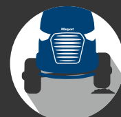
PIVOTING FRONT AXLE