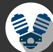
BRIGGS & STRATTON ENGINE