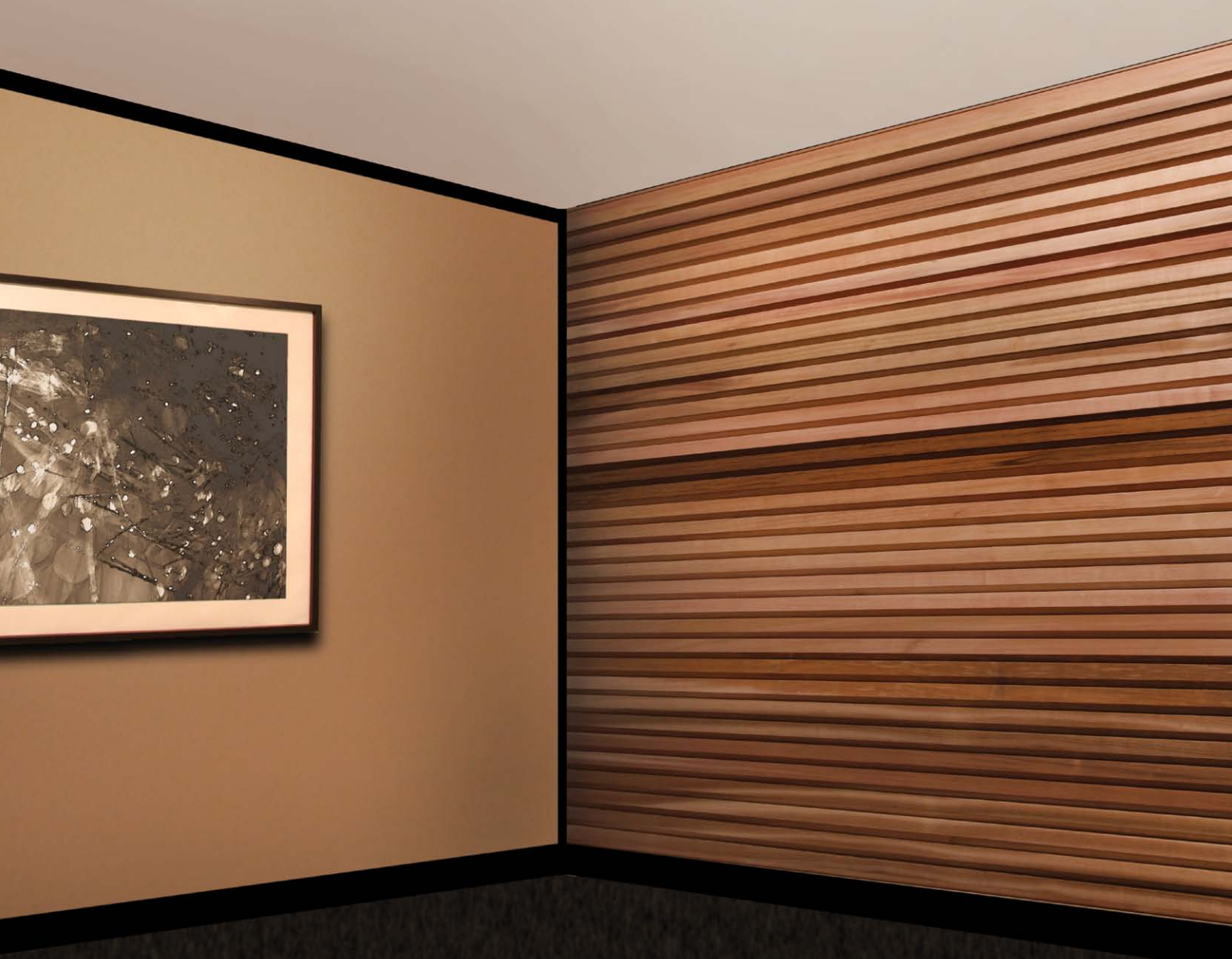
CLCGB 115 x 38