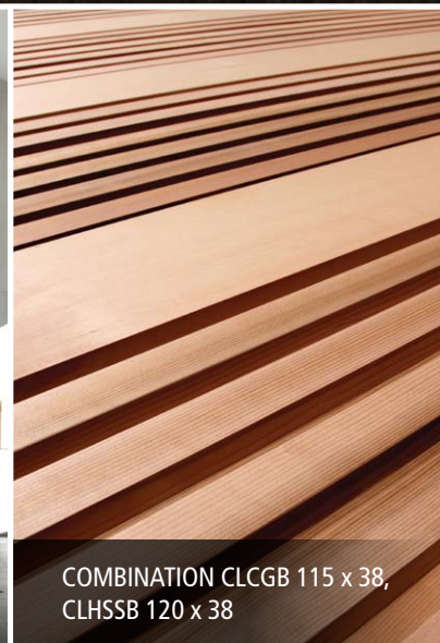
COMBINATION CLCGB 115 x 38, CLHSSB 120 x 38