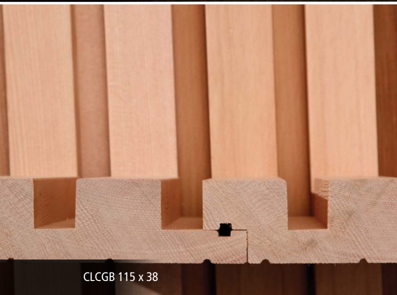
CLCGB 115 x 38