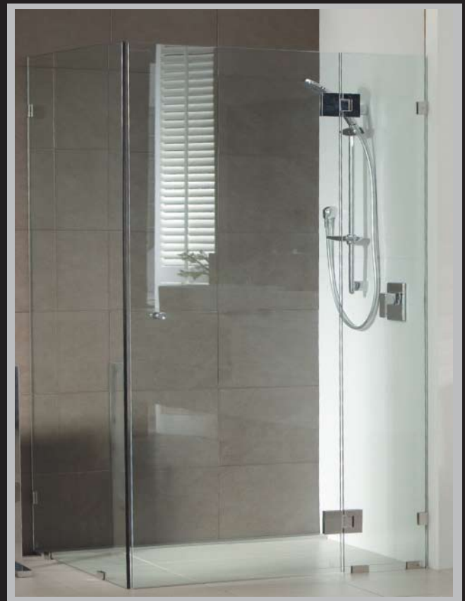
2000mm x 875mm x 10mm Shower Door Kit