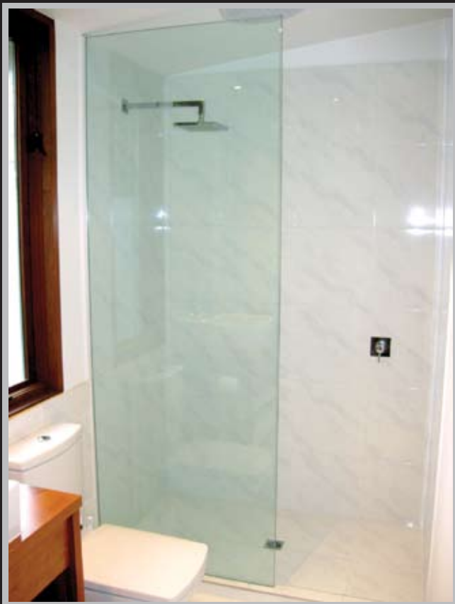
2000mm x 600mm x 10mm Fixed Panel

Made to the highest quality, above and beyond Australian standards all screens are 10mm thick toughened safety glass and include high quality fittings.