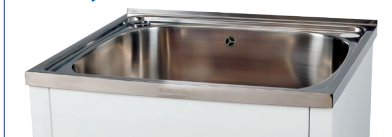
Laundry Unit with added Overflow

71189C Project 45SS Laundry Unit 71189OF Project 45SS Laundry Unit with Overflow