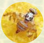
Mediterranean fruit fly*