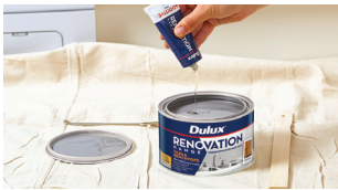
Add the additive and stir well