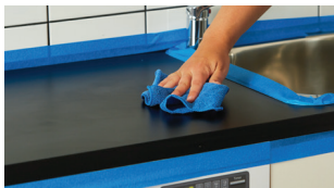
Clean with a damp cloth before applying topcoat

On Benchtop and Splashback areas apply Dulux Renovation Range Clear Coat as the final coating. This will add a layer of protection to the Dulux Renovation Range topcoat.