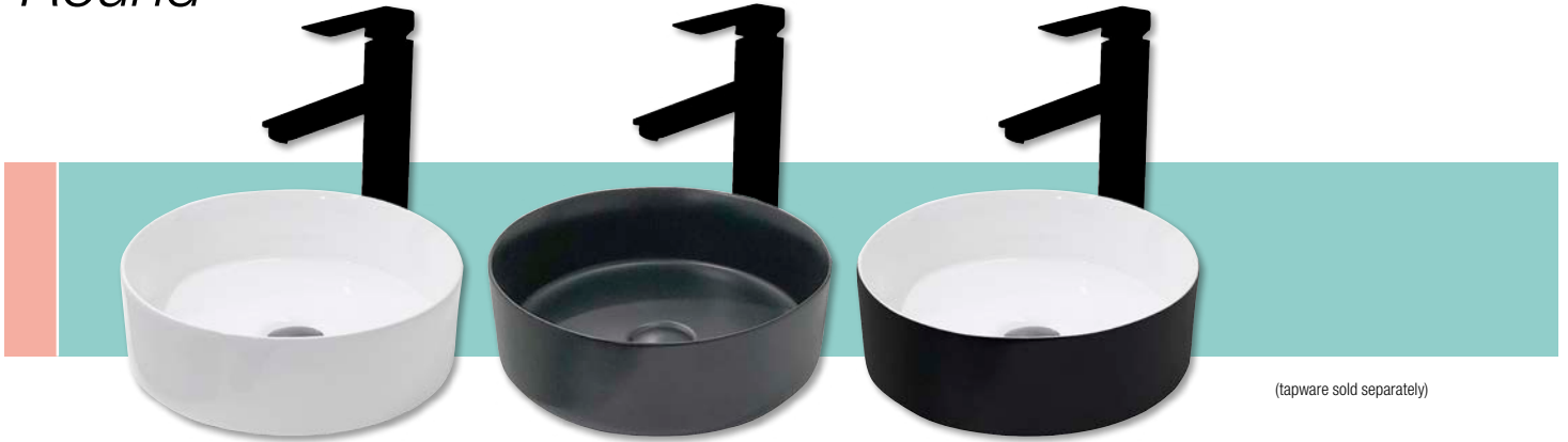
(tapware sold separately)

With its beautiful, classic rounded form, flat base and fine ceramic edges, the Thin Edge above-counter basin makes for a striking feature in the contemporary bathroom, especially when paired with a stone benchtop.