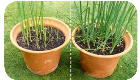
UNTREATED GOGO JUICE

GOGO Juice is ideal for your vegetable patch, natives and all potted plants, as well as being a great kick start for your compost heap by adding the microbes needed to help speed up the process.