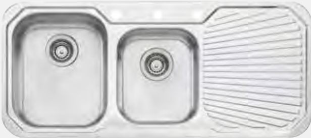
LEFT HAND BOWL SINK