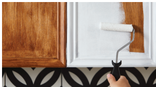
Roll on topcoat