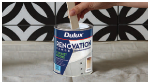
Stir well before use