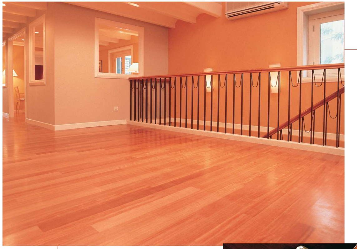
Excellent for Commercial & Domestic Applications