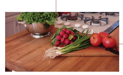
Wood Veneering and Edge Filling