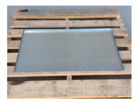
Step 3: Screw inner top panel in place.

Step 1: Lay down bottm panel folded edges facing upwards and non folded edge to the front.