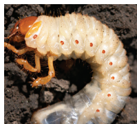
Scarab Beetle Larvae

Azalea Lace bugs, Aphids and Scarab Beetle Larvae are common bugs that attack your plants, in gardens and in pots. Control these type of pests and protect your plants from future attacks whilst promoting plant health all year round.