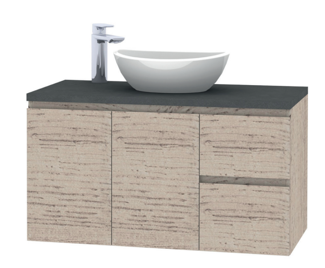
Mont Albert 900 wall hung vanity, in Light Ash, Concrete Stone top, Organic basin, RHS drawers with a 10:00 taphole