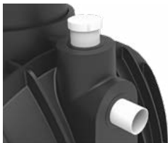
Inlet and outlet fittings come pre-assembled for a 10 minute hook-up

*Number of persons is approximate, please check with your local council.