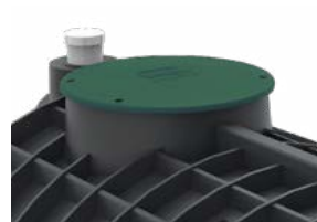
Lid suitable for vehicle traffic, tested to 500kg loading