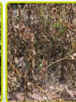
24 hours later