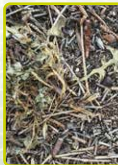
24 hours later