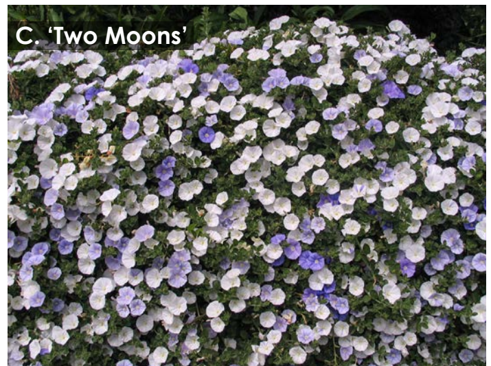
C. 'Two Moons'