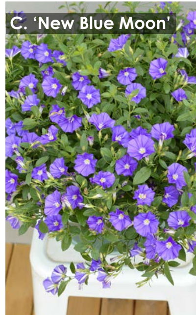
C. 'New Blue Moon'

Grows well in most soils that are well draining. Watering requirements are low once established requiring only occasional deep watering over extended periods of heat. No pruning required. An addition of a slow release fertiliser in spring recommended to encourage profuse flowering.