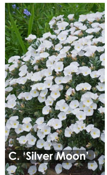
C. 'Silver Moon'

Landscaping favourites as reliable and ornamental ground covers for sunny sites. This collection features varieties selected that stand out in habit, ease of culture, ornamental features and reliability. Perfect garden companions include Euphorbia 'Ascot Rainbow', Salvia HEATWAVES, Hemerocallis 'Stella Bella' and Penstemon BELLTOWER varieties.