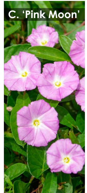
C. 'Pink Moon'