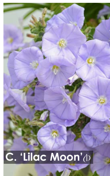
C. 'Lilac Moon' (b)