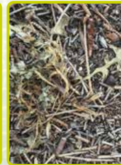
24 hours later