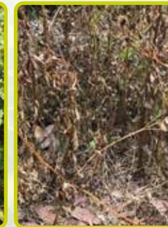
24 hours later