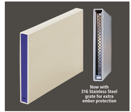
Now with 316 Stainless Steel grate for extra ember protection