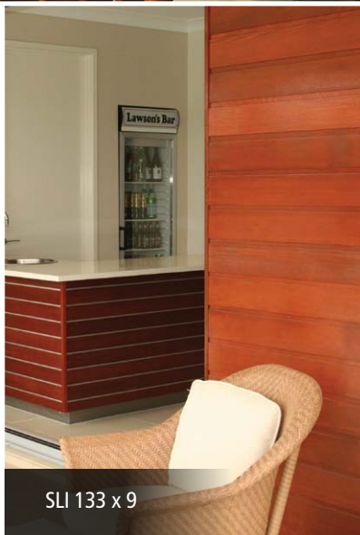
SLI 133 x 9