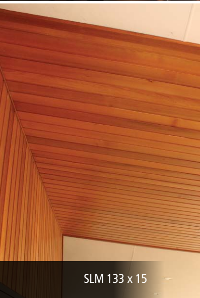
SLM 133 x 15