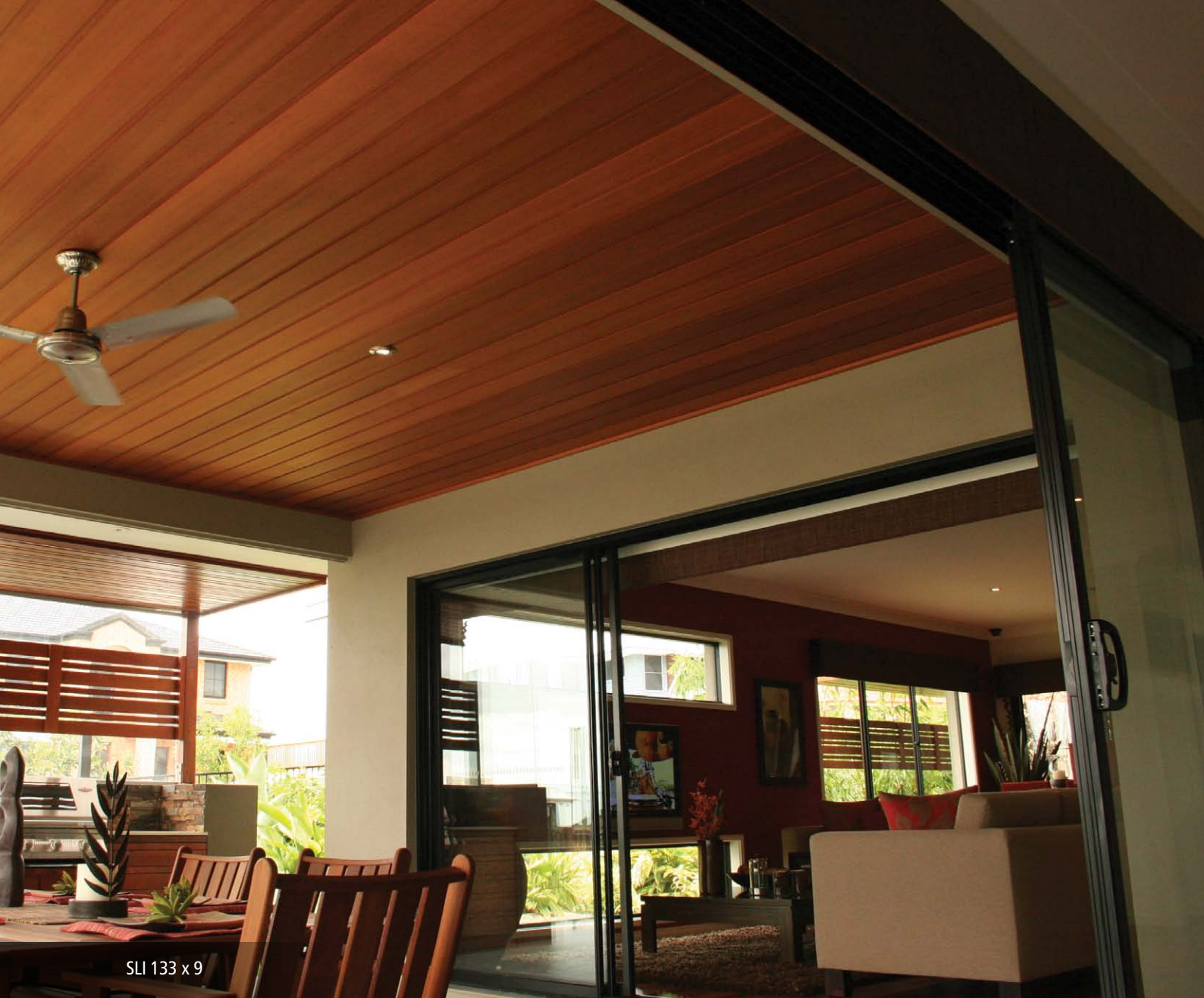
SLI 133 x 9