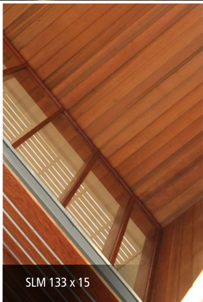
SLM 133 x 15