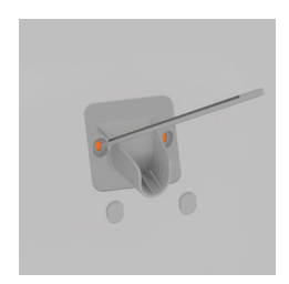
Holding the wall bracket firmly in place, carefully remove the vacuum. Using a pencil make a small mark for each screw.