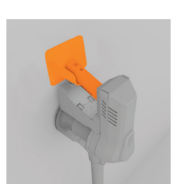
Attach the wall bracket to the handle.