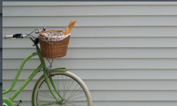
Linea Weatherboard 150mm

Unlike traditional timber, fibre cement weatherboards are stable. Linea weatherboards will maintain their integrity and appearance significantly longer than timber. Even when moisture gets in, Linea weatherboards resist swelling, shrinking and cracking to hold paint longer. So you can pick dark modern paint colours with confidence.