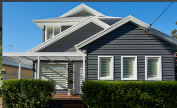
Linea Weatherboard 180mm