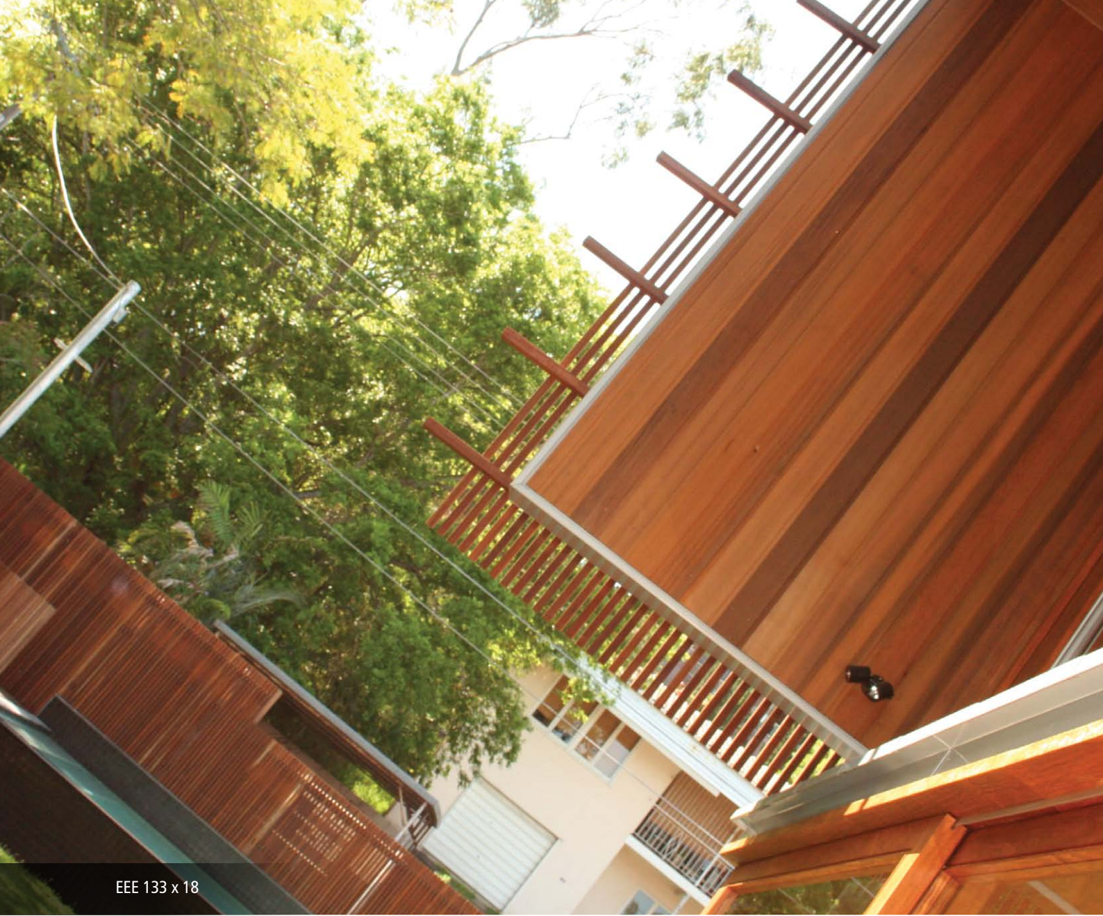
EEE 133 x 18