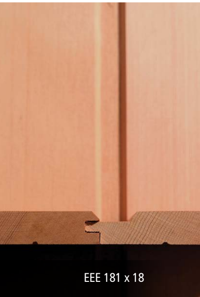
EEE 181 x 18