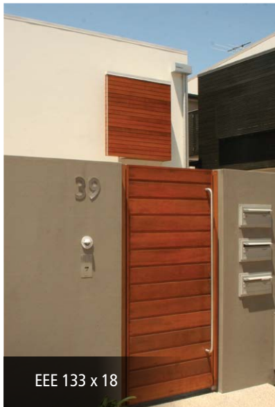
EEE 133 x 18