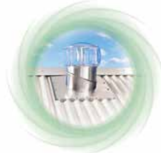
TurboBeam UV stable polymer with clear acrylic head