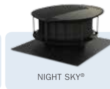
NIGHT SKY ®