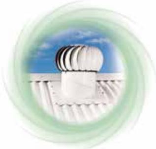
WindMaster Aluminum vent in a mill finish and range of colours

Wind Driven Ventilation. Effective and energy free ventilation even in the lightest winds. The systems combine classic design with high tech features for energy efficient and long lasting, maintenance free performance.