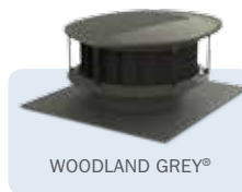
WOODLAND GREY ®