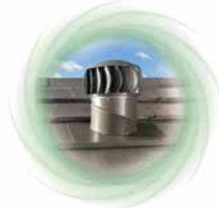
SupaVent UV stable polymer in a range of colours