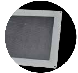
Grilles and eave vents To be used with roof top ventilators to improve air flow

For more information call 1300 858 674 or visit edmonds.com.au