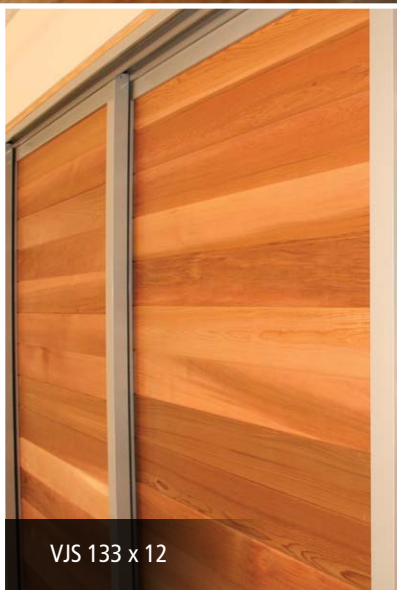
VJS 133 x 12