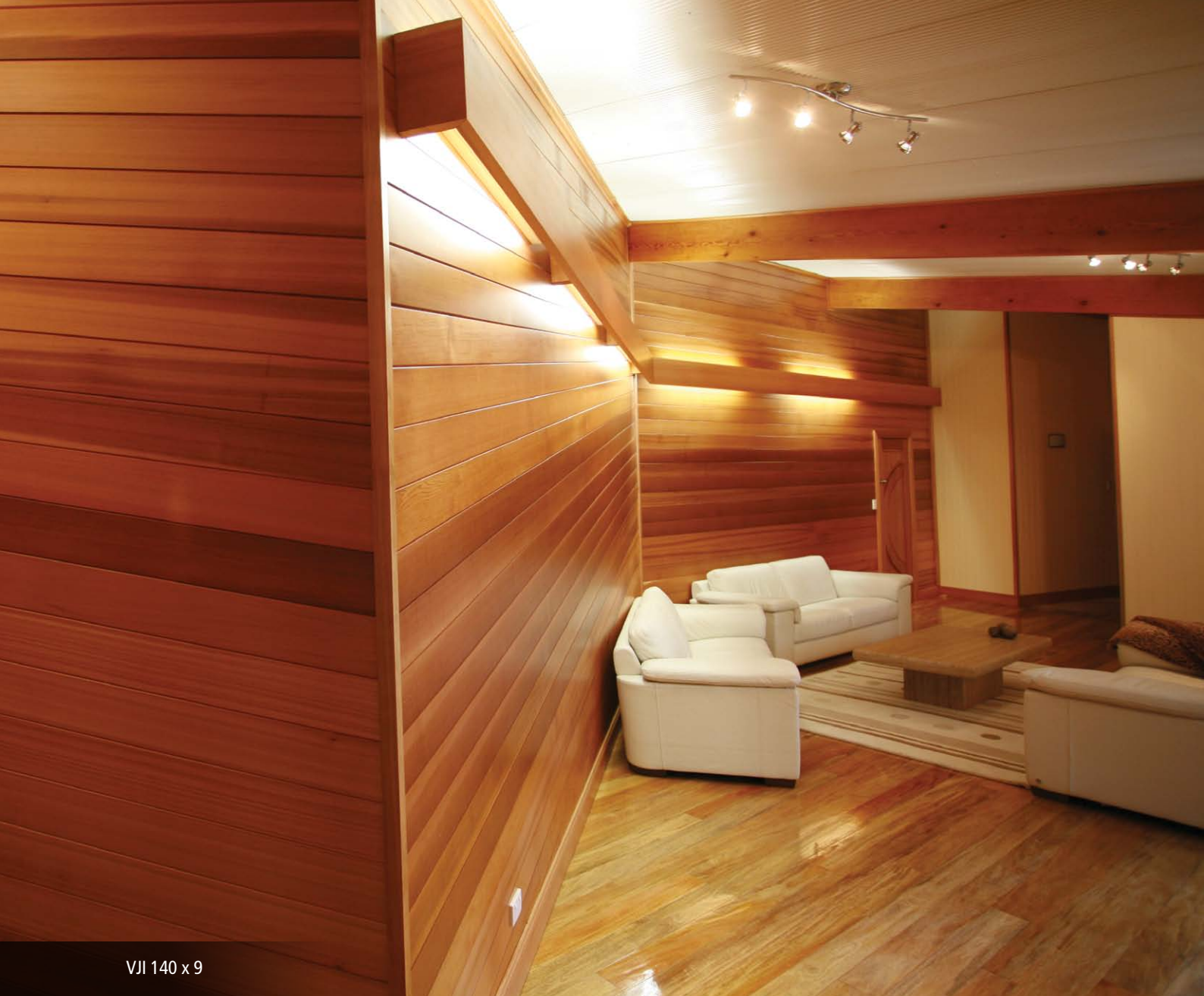
VJI 140 x 9