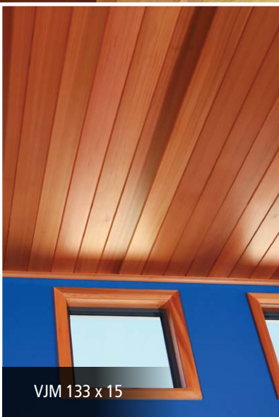
VJM 133 x 15