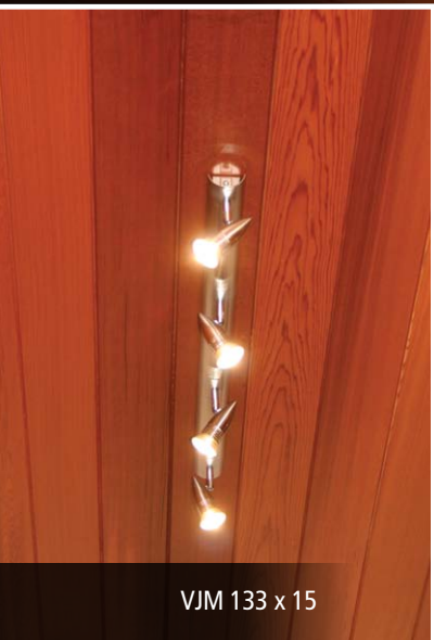
VJM 133 x 15