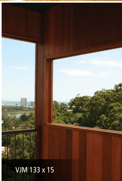
VJM 133 x 15