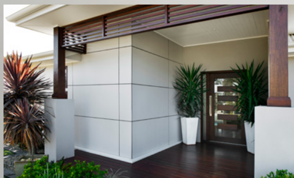
Matrix Cladding in a horizontal layout