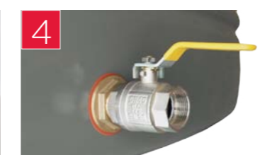
4 Solid brass threaded Outlet with an approved Ball Valve.