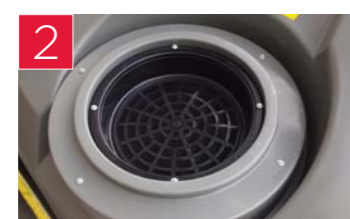
2 Mosquito proof leaf screen.