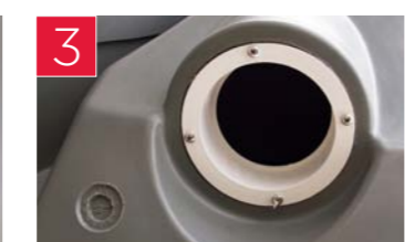
3 90 mm Overflow fitting.