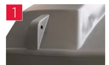
1 Moulded lugs for easy lifting and tie-down points.