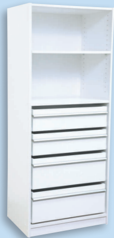
MAXI ULTRA 315C 1495h x 608w x 430d 1 adjustable shelf 2 jumbo drawers 2 standard drawers F/L 2662045

These Multistore wardrobe storage units are available in selected stores and from The Bunnings Special Orders Desk.