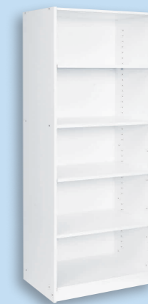
MAXI 716 1650h x 608w x 450d 4 adjustable shelves F/L 2590116