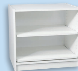
LSS 550 550h x 608w x 430d 2 pull out shelves F/L 2668921