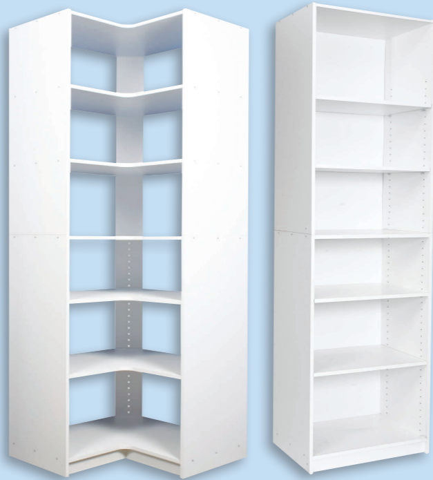
EXC-CNR 2000h x 800w x 450d 3 fixed shelves 2 adjustable shelves F/L 2590134