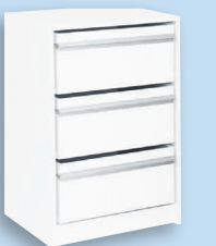
MSM 400J3 745h x 500w x 450d 3 jumbo drawers F/L 2660971