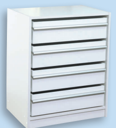
MAXI ULTRA 450 745h x 608w x 430d 4 standard drawers F/L 2662049