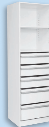
MSM C16 1650h x 500w x 450d 1 adjustable shelf 3 standard drawers 2 jumbo drawers F/L 2661032