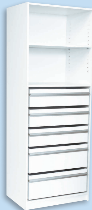
MAXI C16 1650h x 608w x 450d 1 adjustable shelf 3 standard drawers 2 jumbo drawers F/L 2590118