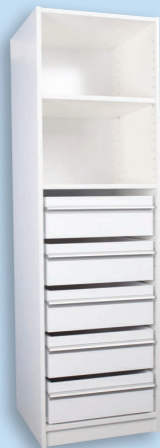
ULTRA 515 1495h x 450w x 430d 5 standard drawers 1 adjustable shelf F/L 2661090