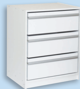
MAXI 400J3 745h x 608w x 450d 3 jumbo drawers F/L 2590121