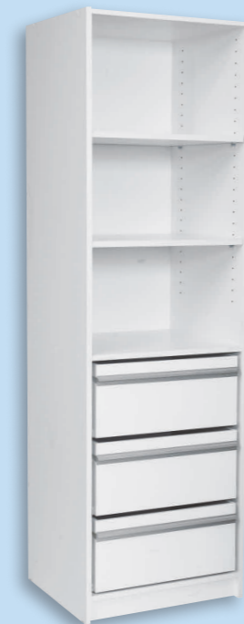
MSM 16J3 1650h x 500w x 450d 2 adjustable shelves 3 jumbo drawers 2 standard drawers F/L 2660010