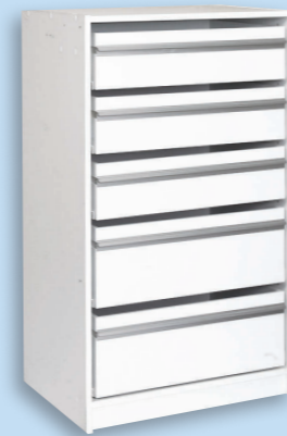
EXB-5C 1035h x 608w x 450d 3 standard drawers 2 jumbo wire baskets F/L 2590131