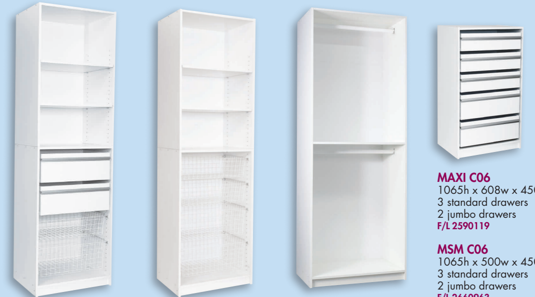
EXC-2B 2000h x 608w x 450d 2 adjustable shelves 2 jumbo drawers 2 jumbo wire baskets F/L 2590128

These Multistore wardrobe storage units are only available to order from The Bunnings Special Orders Desk.