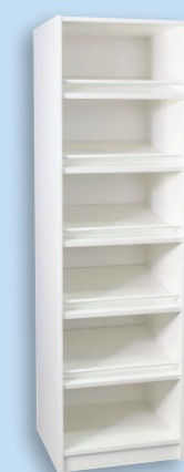
LSR 450 1495h x 450w x 430d shoe rack holds 12prs F/L 2668919