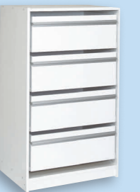
EXB-4J 1035h x 608w x 450d 4 jumbo drawers F/L 2590132