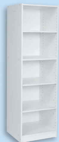
ULTRA 715 1495h x 450w x 430d 4 shelves. F/L 2661082