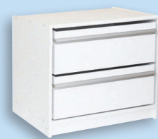
LSD 550 550h x 608w x 430d 2 jumbo drawers 2 standard drawers F/L 2668920