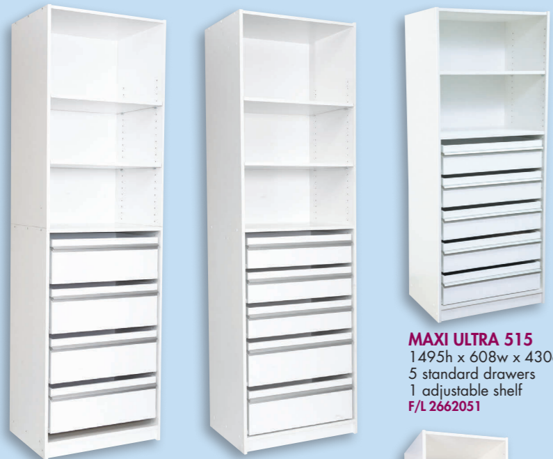
MAXI ULTRA 515 1495h x 608w x 430d 5 standard drawers 1 adjustable shelf F/L 2662051

These Multistore wardrobe storage units are available in your local Bunnings store.