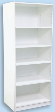
MAXI ULTRA 715 1495h x 608w x 430d 4 shelves. F/L 2662052