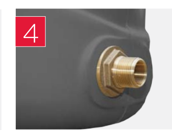
25mm Solid Brass Outlet