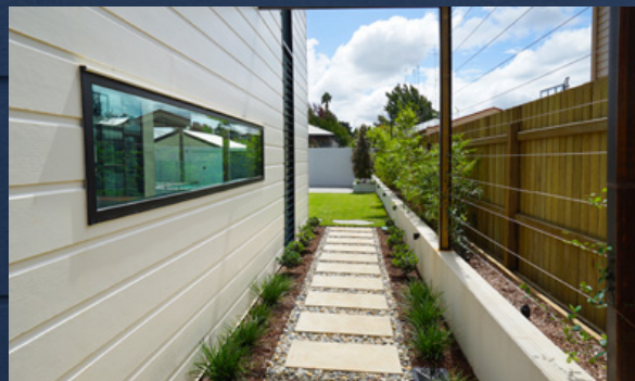
Stria 255mm Splayed Profile