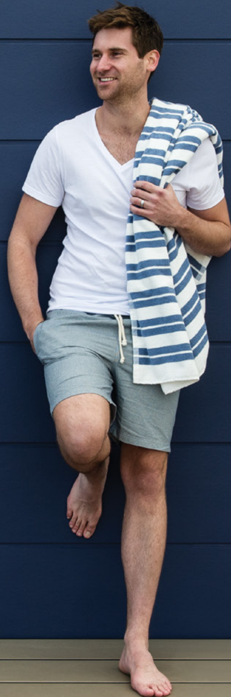
Stria 325mm Standard Profile