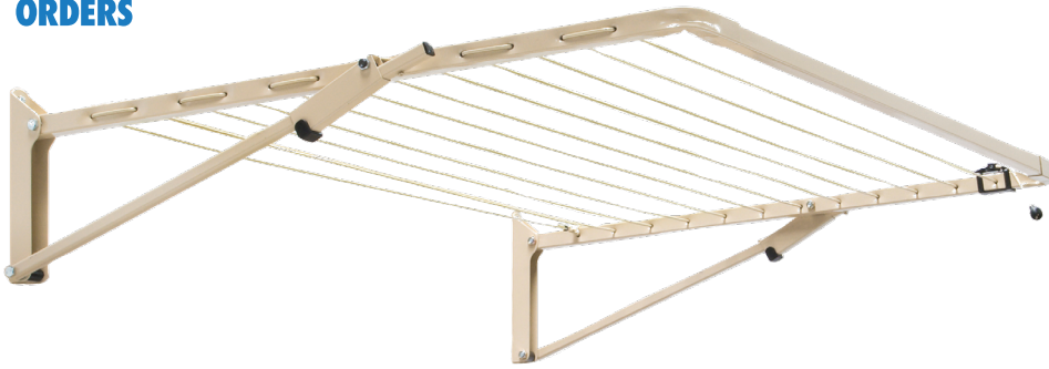
Classic Cream model shown