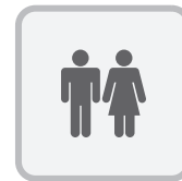
SUITS 1-2 PEOPLE