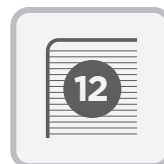
NUMBER OF LINES