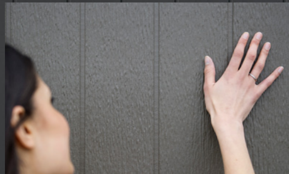
Axon Cladding 133mm Grained

Creating a strong visual impact for your building is easier than ever with Scyon™ Axon™ cladding. Fast and easy to install as well as robust and versatile, Axon is the perfect antidote to boring walls. The vertical 9mm wide grooves imitate vertical joint timber boards with a 1200mm wide fibre cement sheet. The grooves complement classic and modern building designs to create stand out facades, and bring texture and interest to outdoor rooms. Axon cladding is on-trend for boxy room extensions and mixed material designs.