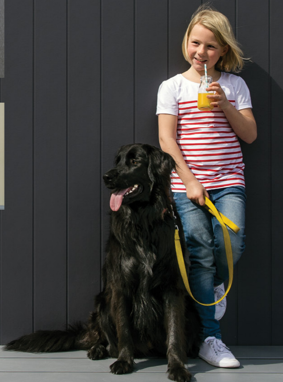
Axon Cladding 133mm Smooth