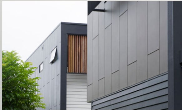
Matrix Cladding in a staggered vertical layout

If you get your home design inspiration from the modern, high-end apartment, office and retail complexes of urban landscapes, then Scyon™ Matrix™ cladding is for you. Just by adding a Matrix feature wall or architectural highlight to your home, you can transform even the most traditional design into something unique and eye-catching. Or use Matrix cladding as your primary building material to create a bold and industrial look throughout.