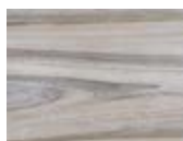
Veneer 1: Café Oak