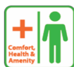
Comfort, Health & Amenity

Products are to be stored standing upright and on pallets not more than two high. Product warranty is voided for any product stored horizontally resulting in squeeze or crush. Returns of product displaying effects of deformation due to incorrect storage practices will not be accepted.