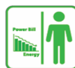
Reduced Power Costs